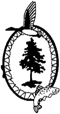
G.C.C.E.I. est. 1974